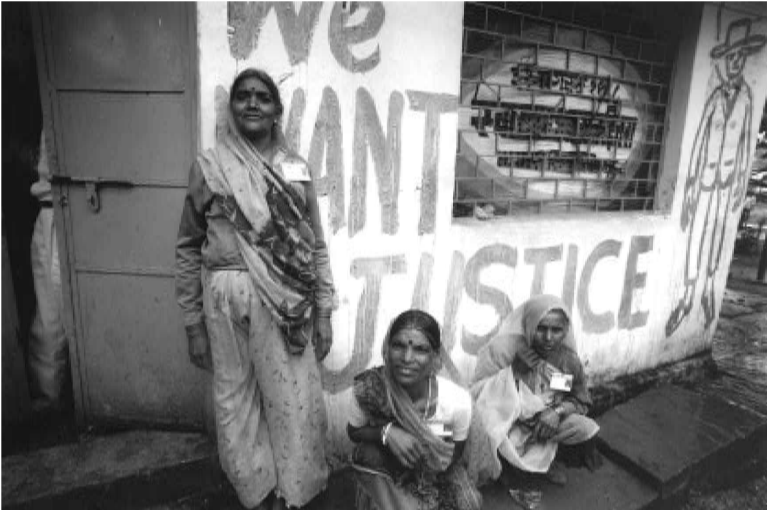
Women from the survivors' organization (Gas Peedit Mahila Stationery Karmachari Sangh) on the 15th anniversary of the Bhopal accident.